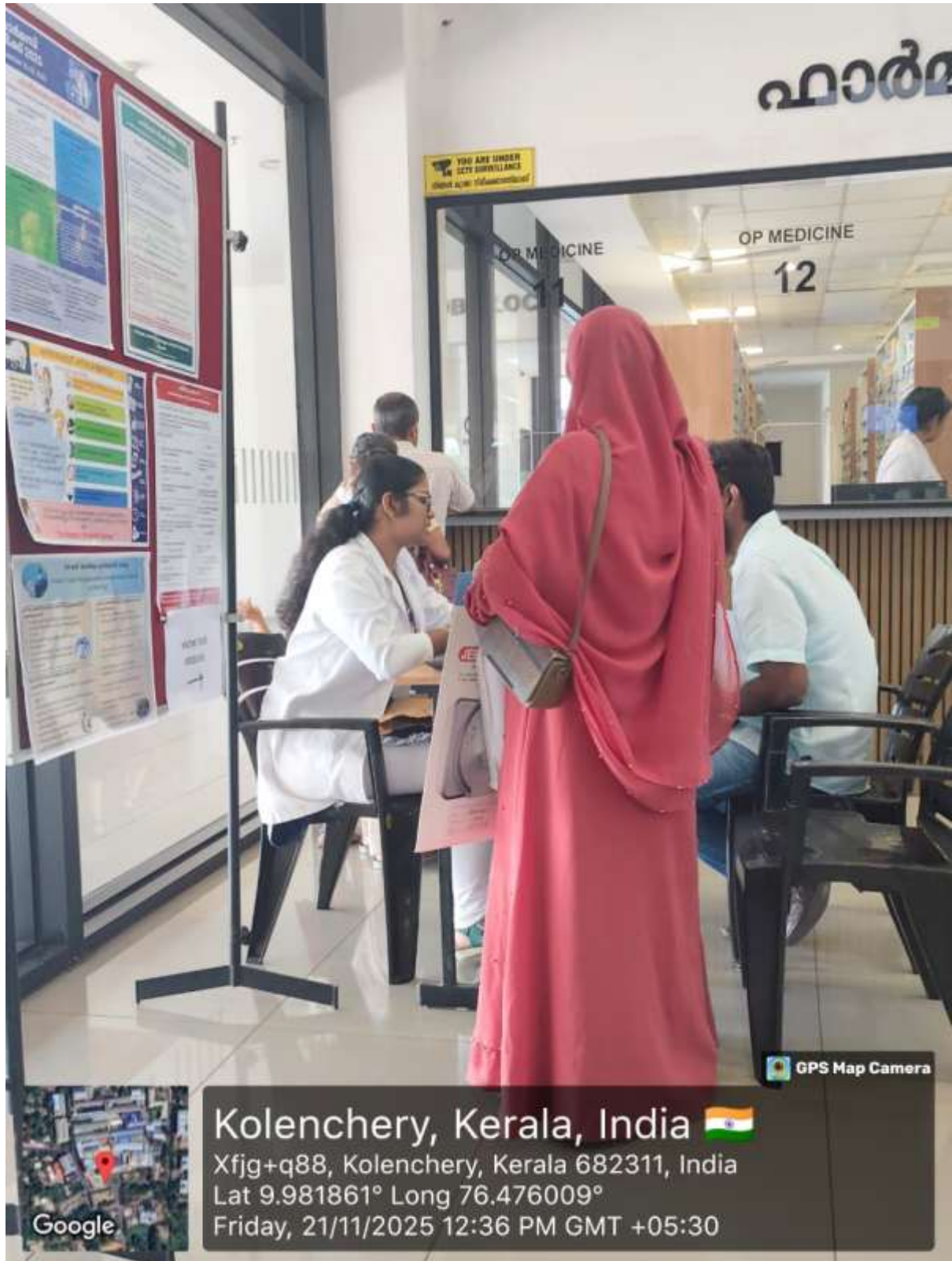
Photo 2. During the session